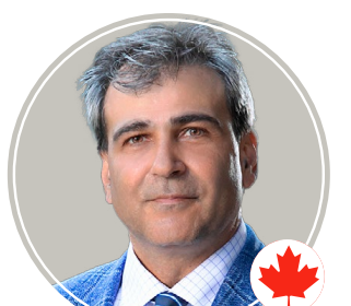
Quantum creativity: how small actions lead to big impact!